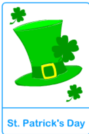
St. Patrick's Day