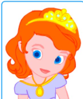
Sofia the First