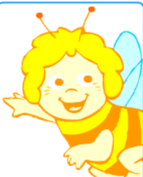
Maya the Bee